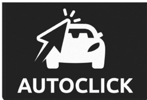
VW2 Vinyl Wallets

1 Spot Colour Imprint 3" x 4.5" (folded) 6" x 4.5" (opened)