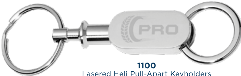
1100 Lasered Heli Pull-Apart Keyholders Chrome Finish Laser Engraving on Front 1" x 4"