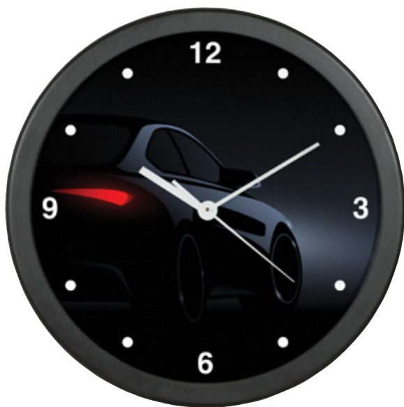
CLKE10 Economy Wall Clock 4 Colour Process Imprint 10" dia.