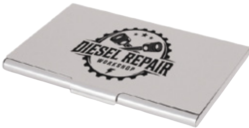
5009A Aluminum Business Card Holder 1 Spot Colour Imprint 2.5" x 3.875"