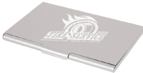
5009AL Aluminum Business Card Holder Laser Engraving on Front 2.5" x 3.875"