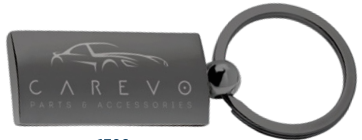
1708 Lasered Epoch Keyholders Gunmetal Finish Laser Engraving on Front 0.875" x 3.25"