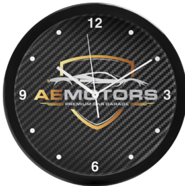
CLKE12 Economy Wall Clock 4 Colour Process Imprint 12" dia.