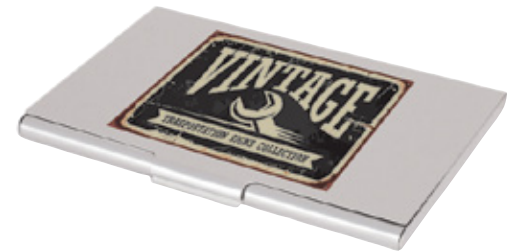
5009A4 Aluminum Business Card Holder 4 Colour Process Imprint 2.5" x 3.875"